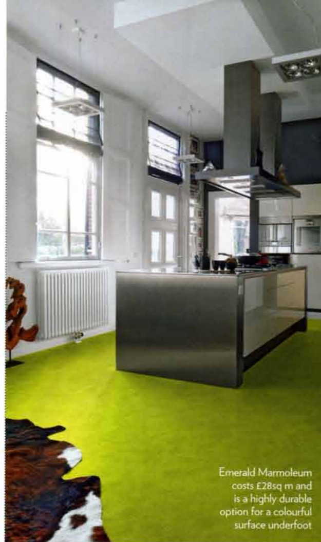
Emerald Marmoleum costs £28sq m and is a highly durable option for a colourful surface underfoot

Q I WANT BRIGHT FLOORING Over the last few months I've bought quite a few issues of your brilliant magazine, as I'm installing a new kitchen. However, I'm still struggling with my flooring decision. I want something plain in a bright, bold colour – possibly an azure blue or even green or yellow. The thing is, I'm desperate to avoid hard tiles that feel cold and aren't child-friendly, while I think vinyl may well get marked by my high heels. Finally, we only have a tight budget to work with. Please help! LIZZ MARTIN, via email